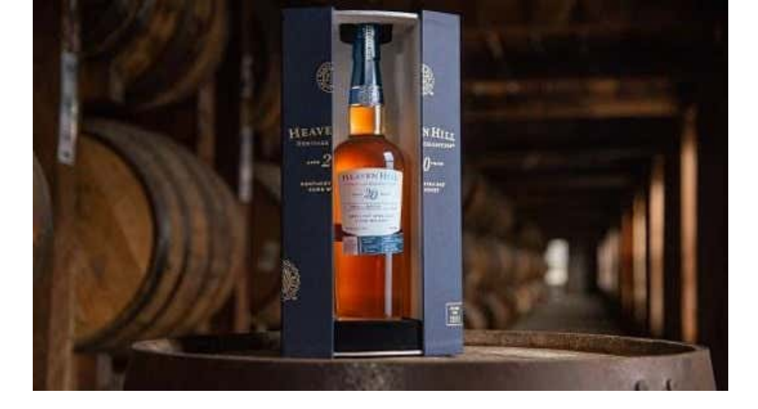
Soave Gains ANew Identity

Let's not talk about what amenities Palmasola has. The better question is: which ones doesn't it?